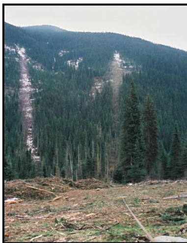
Figure 3. Harvesting narrow corridors with a cross-valley skyline system minimizes the need for roads.

The rural community surrounding McBride and indeed the Village of McBride, obtains all of its drinking water from the many small creeks that run from the face of the Rocky Mountain Trench. It gives the community great comfort to know that it is in charge of the management of the forest surrounding its drinking water (from “the Proposal”).