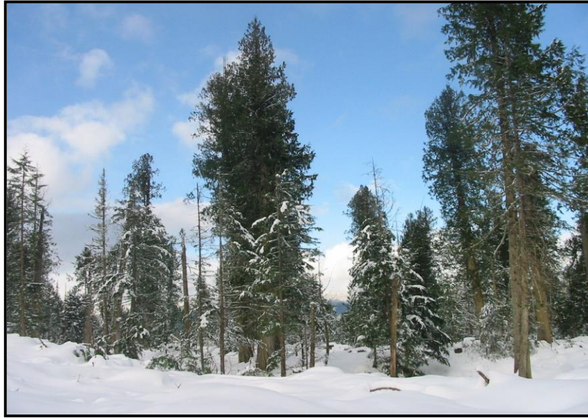
Figure 5. A visually aesthetic harvest area.