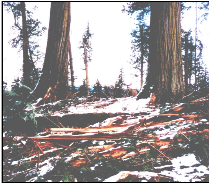
Figure 6. Mule deer using a partial-harvest area.