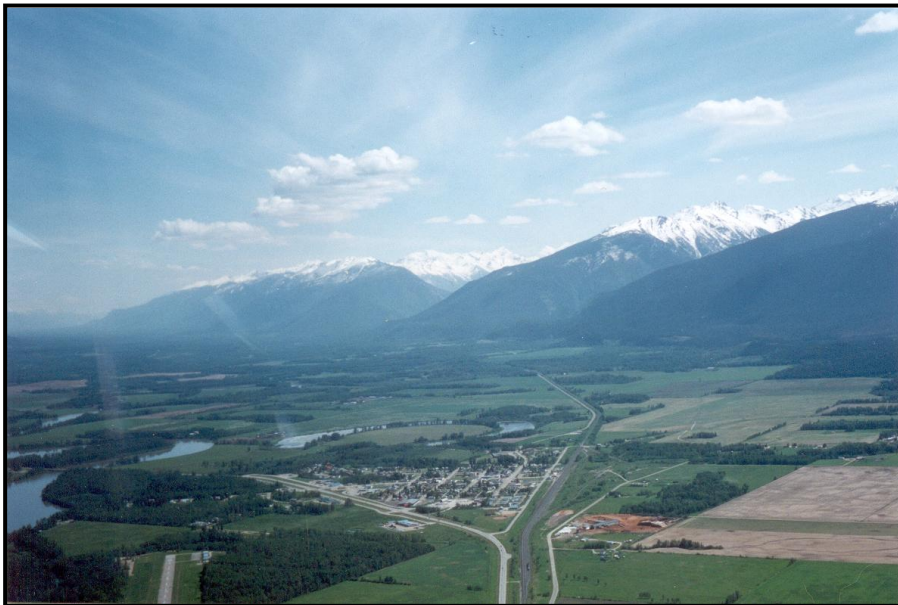
Figure 1. Village of McBride.

Unforeseen events may occur within the term of this plan and render certain commitments or objectives unachievable. Conversely, the resources required to significantly expand upon commitments or further define objectives may become available. It would then be desirable to amend the Management Plan to allow timely and continuous improvement of the management of the Community Forest.